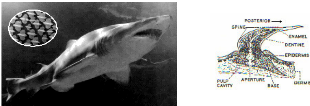
Figure 3: Use of 'Local Quality' Inventive Principle in Shark Skin

This is perhaps most vividly seen by considering how the shark resolves the speed/energy contradiction. The shark is the fastest living sea-creature. It achieves this in no small part due to the profile of the myriad tiny protruding scales which cover it's skin – Figure 3.