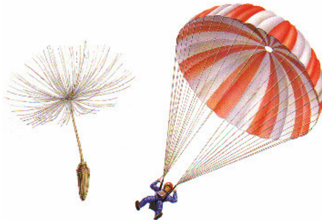
Figure 4: Dandelion Seed as Parachute

It is interesting to note with the dandelion (and indeed many other wind-dispersed seeds found in the natural world) that the method of solving the speed/area conflict is again markedly different to man’s solution strategies.