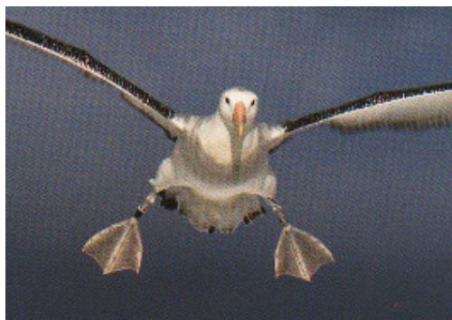
Figure 1: Webbed Feet of Albatross

In terms of the generic parameters of the TRIZ Contradiction Matrix, the conflict occurs between SURFACE AREA OF MOVING OBJECT and WEIGHT OF MOVING OBJECT. The Matrix indicates that the four most common methods used by man to resolve this kind of conflict are:-